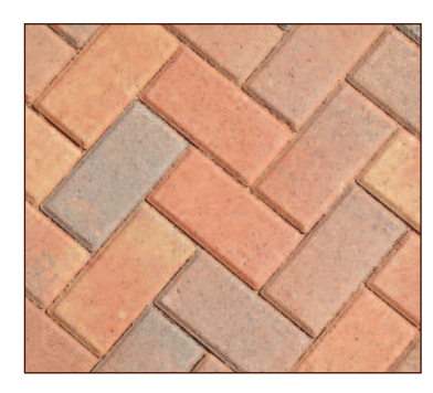
OLD TOWN BLEND