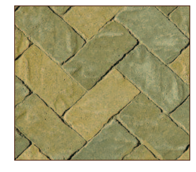
BUFF/CHARCOAL HERITAGE™ SERIES