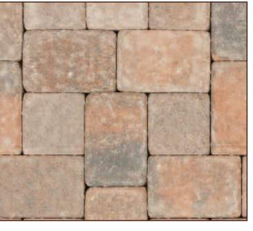
✓ ANTIQUE TERRA COTTA HERITAGE™ SERIES