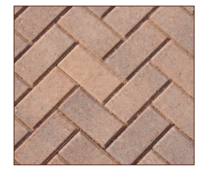
THREE TONE BROWN