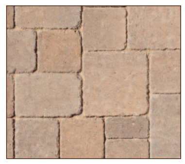
THREE TONE BROWN HERITAGE™ SERIES