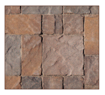
WINTER BLEND HERITAGE™ SERIES

✓ Available only from Colorado Springs manufacturing plant. NOTE: Not all colors are available in all products.